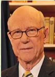
Sen. Roberts (KS)