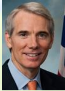
Sen. Portman (OH)