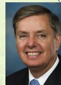
Sen. Graham (SC)