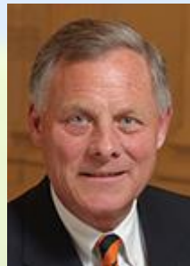
Sen. Burr (NC)