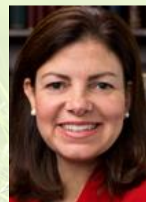
Sen. Ayotte (NH)