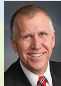
Sen. Tillis (NC)