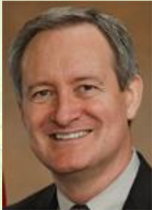
Sen. Crapo (ID)