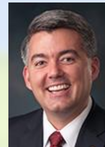
Sen. Gardner (CO)