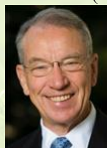
Sen. Grassley (IA)