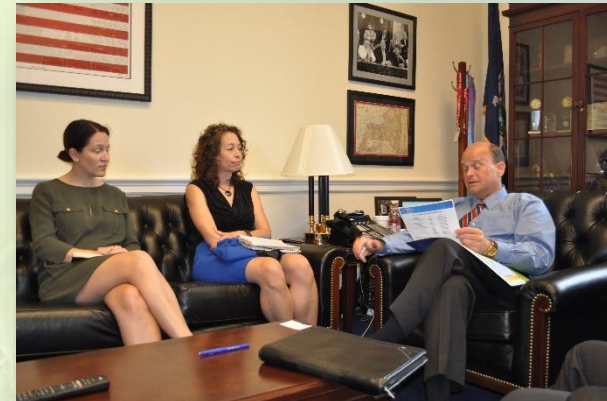
SEIA Board Members talk to Representative Tom Reed (R-NY-23) in his office and were instrumental in gaining his support for the solar industry and the ITC