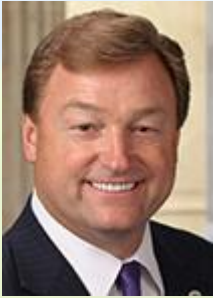
Sen. Heller (NV)