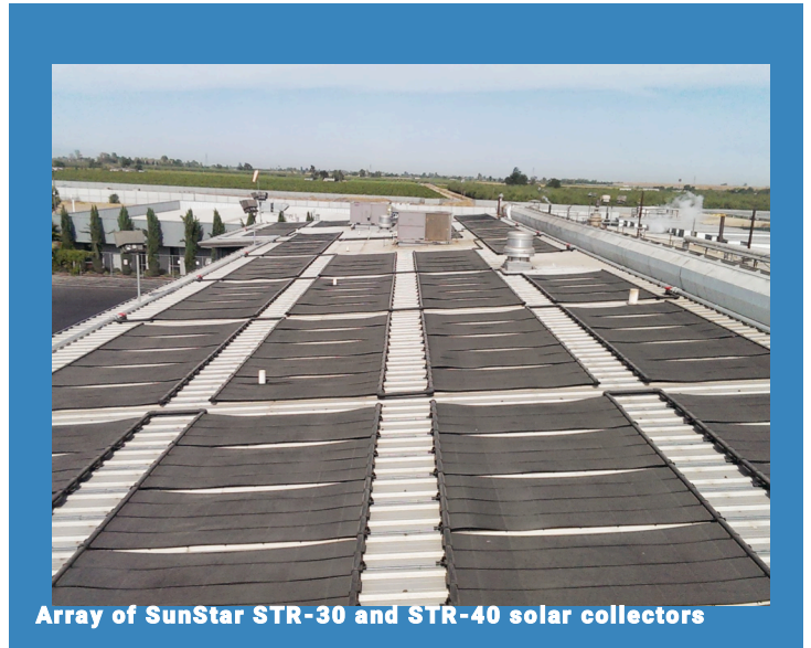
Array of SunStar STR-30 and STR-40 solar collectors

Nextility was able to offer this system for zero upfront cost by making use of the financial incentives available to solar-thermal systems, and by charging Cargill for the energy produced, at a lower rate than Cargill would be paying the utility company. Cargill now pays Nextility for the energy provided, at a rate 40% below what they were previously paying. Cargill immediately cut both its operating costs and carbon footprint through this partnership with Nextility.